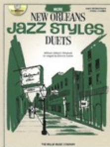
00416806 More New Orleans Jazz Styles Duets (Book/CD)