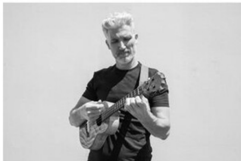
Holding a Ukulele with a Strap