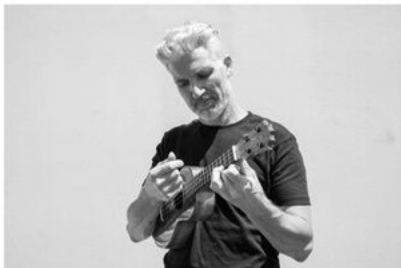
Holding a Ukulele Without a Strap