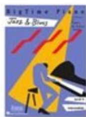
Jazz & Blues FF1011