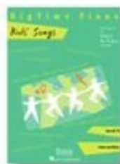
Kids' Songs FF3005