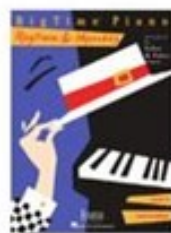
Ragtime & Marches FF1144