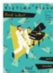
Rock 'n Roll FF1029